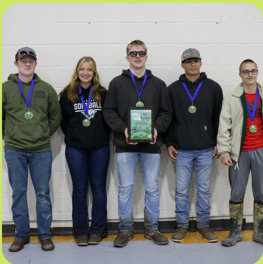
Tinora High School Team 1