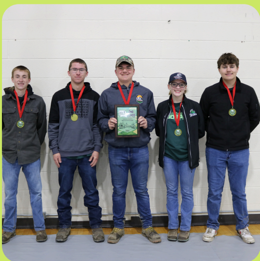
Ft. Jennings High School Team 1